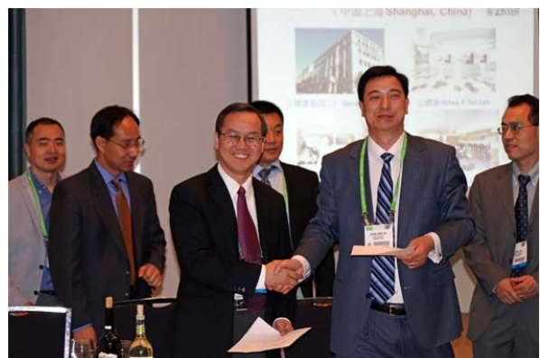
Figure 3. USCACA and Cloud Health Medical Group Ltd. signed the contract of a partnership.