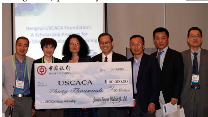
Figure 2. USCACA received a donation for the USCACA-Hengrui EFFORT program from Jiangsu Hengrui Medicine Co., Ltd.

meeting also updated successes in collaborations among USCACA, Chinese Society of Clinical Oncology (CSCO), National Foundation of Cancer Research (NFCR), US National Cancer Institute, Tyler Institute for Genomic Medicine (TIGM), Xinxiang Medical University, China, and several major Chinese pharmaceutical companies (Figure 1). In this meeting, two special